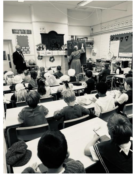
Victorian lunches went down well too!